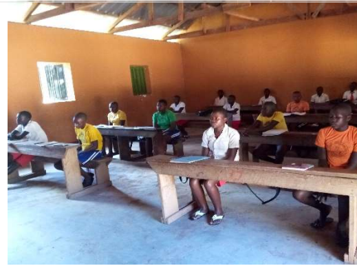
Socially distanced class